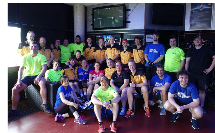
This photo shows the players from 2015 Australian Laser Tag Titles in Rockhampton. We had an awesome week and most of these faces will be there again in 2016! Join us for an awesome time!

Budget in some spending money for time spent socialising or checking out some tourist locations while you are away. We do try to give you spare time to explore while you're visiting.