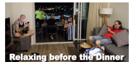
Relaxing before the Dinner

The Dinner for 2016 will be hosted at the site, so it'll be a casual affair, but those that wish to get dressed up are more than welcome to. We will be getting outside catering. Alcohol will be